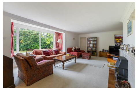
13 Fernhill, Oxshott, KT22 0JH Price Guide £1,500,000 Freehold